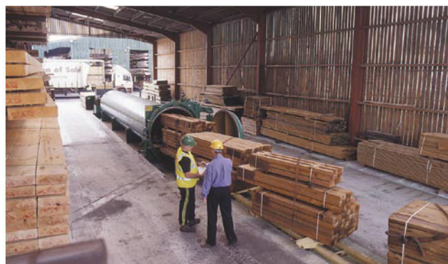
Vacuum high pressure treatment plant.

contact – providing a desired service life ranging from 15 to 60 years. The vacuum process forces the preservative deep into the cellular structure of the timber and generally results in a pale green coloration to the finished component. Additives are available that can give either a rich brown coloration, usually for rough sawn fencing and landscaping timbers, or an effective extra water repellency protection for decorative external timbers, such as decking and cladding timbers.