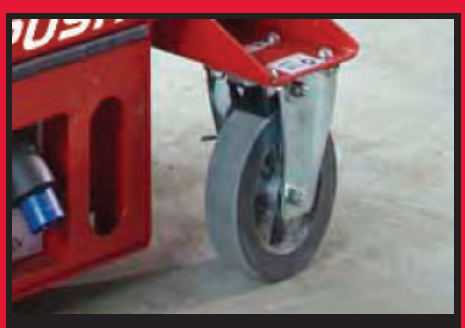
Auto brake prevents surfing