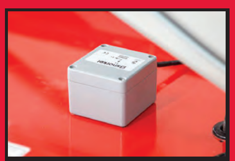
Tilt sensor with built-in isolator only allows use on a level floor