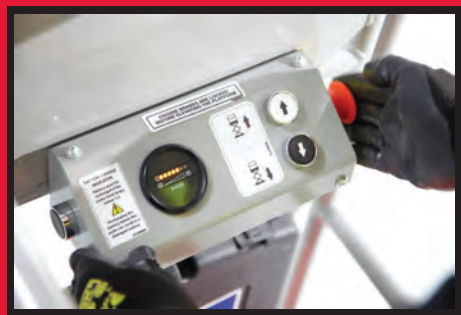
Both hands are safely in the basket when going up or down