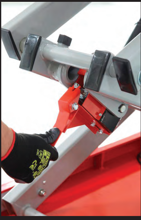
Easy access emergency lowering lever