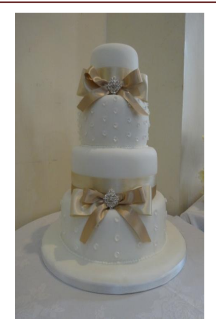
On your Wedding Day let us take care of all your needs Our Wedding Planner will guide you through all your arrangements. We also provide chair

We also provide chair covers and bows, favours, table arrangements and wedding cake contact