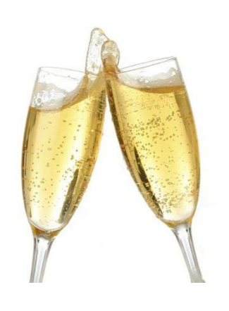
Expert caterers for all your all your Function needs

Birthdays Anniversaries Baby Showers Christenings Christmas Parties Afternoon Teas Private Dining Conferencing