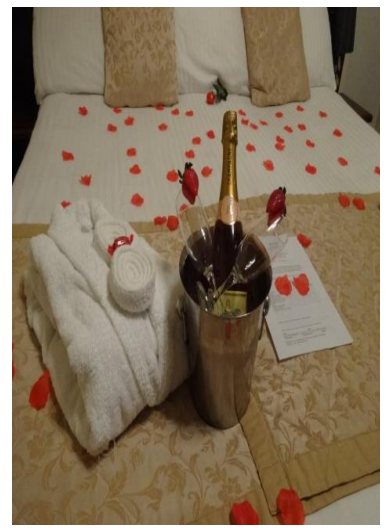
Accommodation We provide a variety of En Suite rooms Twin Bedded Double Beds Single Rooms Selection of Family Rooms All EnSuite with robes, toiletries, tea/coffee