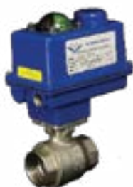
BA-260 BALL VALVE WITH ELECTRIC ACTUATOR