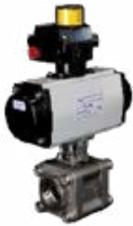
35 SERIES BALL VALVE WITH PNEUMATIC ACTUATOR