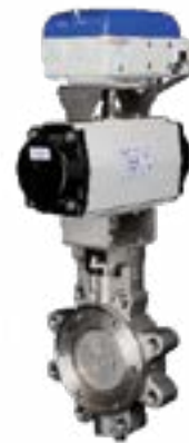
HP SERIES LUG BUTTERFLY VALVE WITH PNEUMATIC ACTUATOR