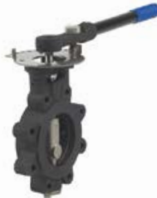
HPILCS WITH LEVER HANDLE