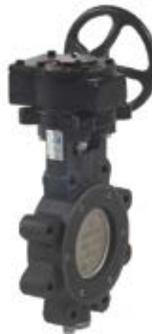
HPILCS WITH GEAR OPERATOR