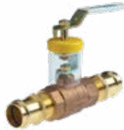
UPBA-100 P2 XH