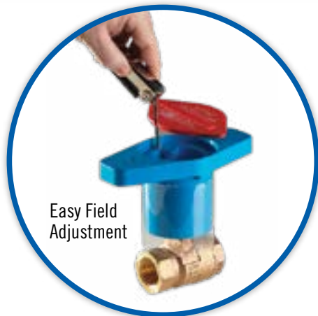
THE INSULATOR/MS™ A Milwaukee/Hammond Valve Product