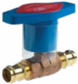
UPBA-400 P2 TIH