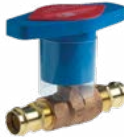
BA-100 P2 TIH