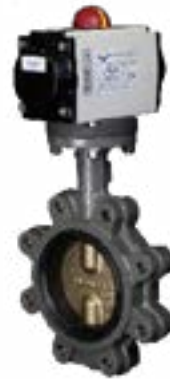
ML SERIES BUTTERFLY VALVE WITH PNEUMATIC ACTUATOR

Double -acting actuator sized for 80 psi air supply 120V four-way Nema 4/4X NAMUR mounted solenoid.-