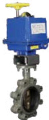
CL SERIES BUTTERFLY VALVE WITH ELECTRIC ACTUATOR

120VAC Nema 4 rated electric actuator 25% duty cycle with 2 limit switches/ remote light indicator, Manual override, visual position indicator.