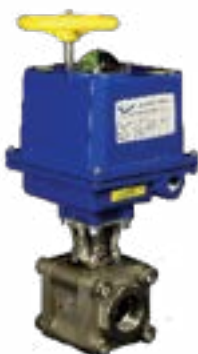
35 SERIES BALL VALVE WITH ELECTRIC ACTUATOR