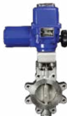
HP SERIES LUG BUTTERFLY VALVE WITH ELECTRIC ACTUATOR