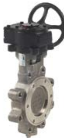
HPILSS WITH GEAR OPERATOR