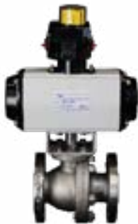
F20 SERIES BALL VALVE WITH PNEUMATIC ACTUATOR WITH LIMIT SWITCH