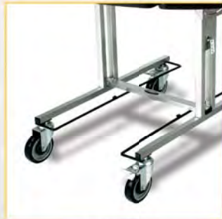
Standard hot box rails