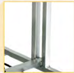
Brushed stainless steel frame