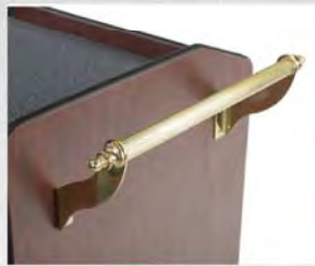
Model 6004 Reeded brass handle