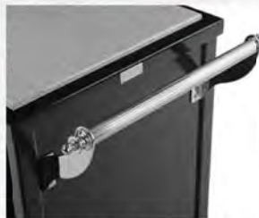
Model 6004-PS Reeded chrome plated handle