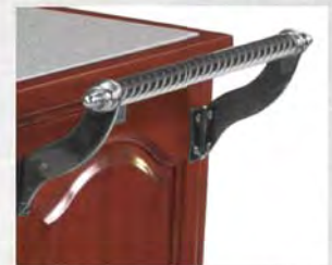
Model 6007-PS Roped chrome plated handle