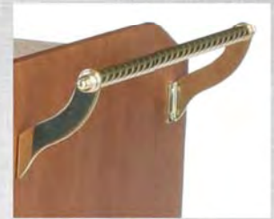
Model 6007 Roped brass handle