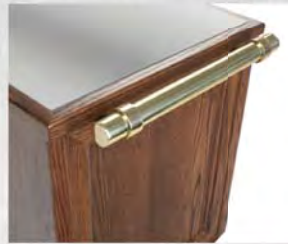
Model 6005 Polished brass handle