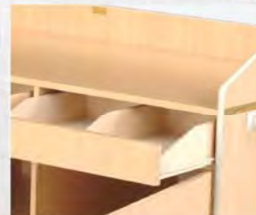
Model 6245 Laminate drawer with dividers Model 6247 - Wood veneer version