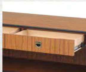
Model 6241 Laminate drawer Model 6249 - Wood veneer version