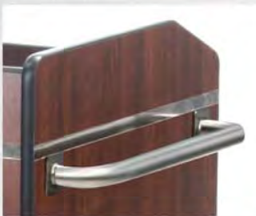
Model 6002-SS Stainless steel stub handle