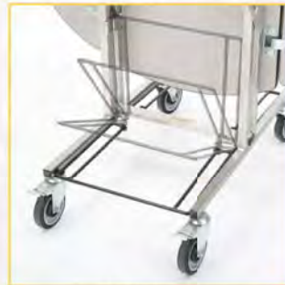
For improved nestability footprint

To order dropshelf, specify WDS at time of ordering: (ex: #####-WDS)