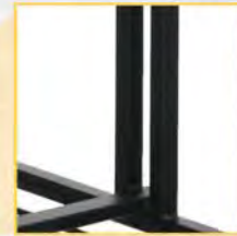
Textured black powder epoxy painted steel frame