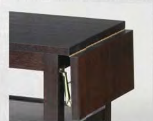
Model 6240 Veneer drop leaf Model 6239 - Laminate version