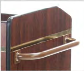
Model 6002 Painted stub handle