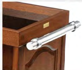
Model 6005-PS Polished stainless steel handle