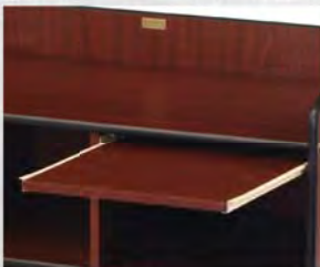
Model 6223 Laminate pull-out shelf Model 6228 - Wood veneer version