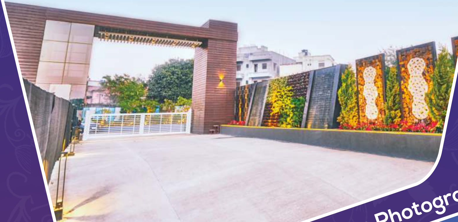
Actual Site Photographs