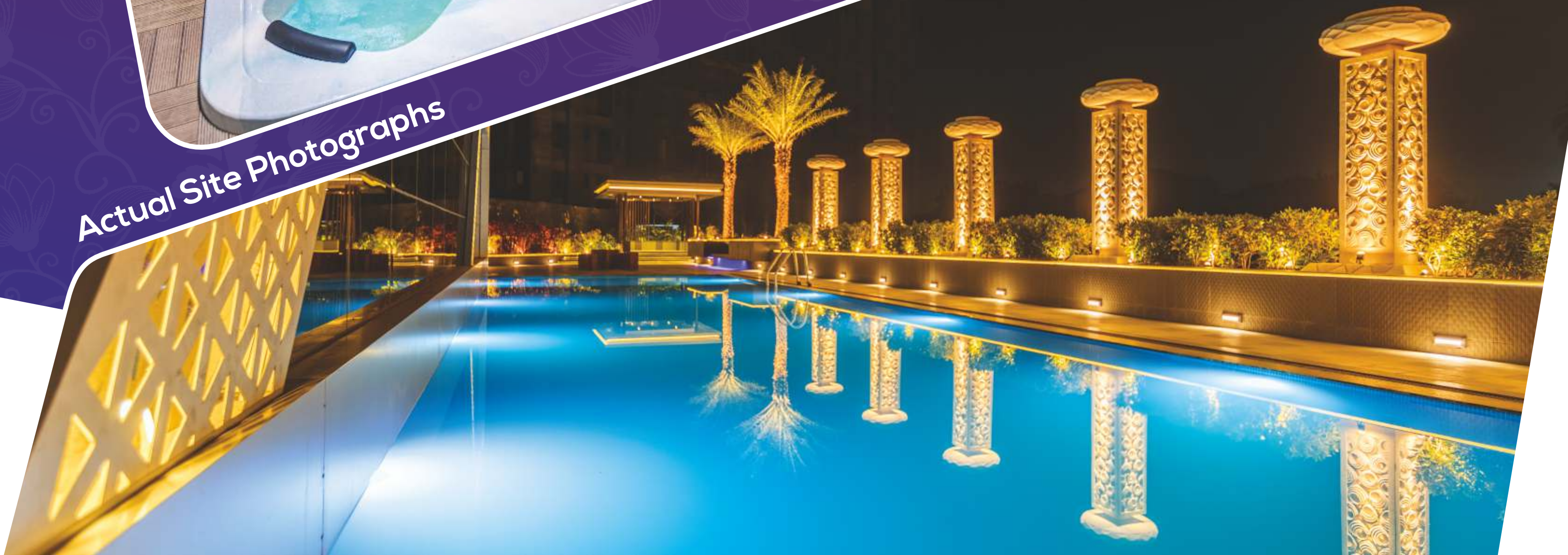
Actual Site Photographs