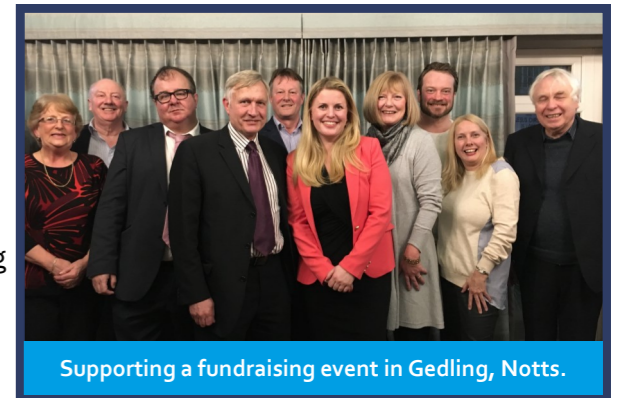
Supporting a fundraising event in Gedling, Notts.

The work to disengage from the European Union has already begun. A new government Brexit