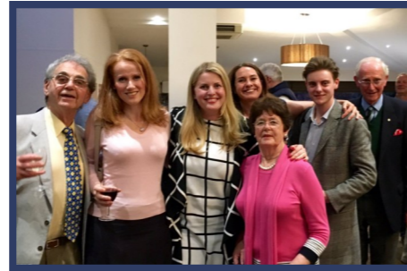
Above: Taking part in an EU Referendum debate in Sherwood , Nottinghamshire.