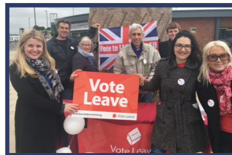
Below: Campaigning with Vote Leave activists in Clay Cross , Derbyshire.