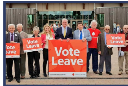
Below: With MPs and activists supporting the Leave campaign at the Lincolnshire show.