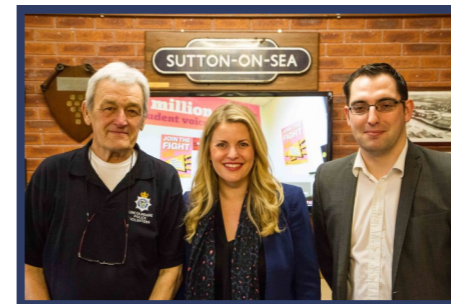
Above: Meeting members of the local community in Sutton-on-Sea on the Lincolnshire coast