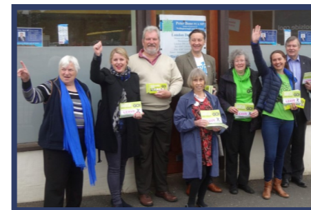
Below: Campaigning with Grassroots Out activists in Wellingborough , Northamptonshire.