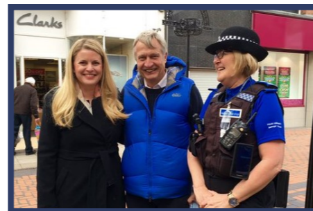
Below: Meeting the local police with PCC candidate Mark Harper in Retford , Nottinghamshire.