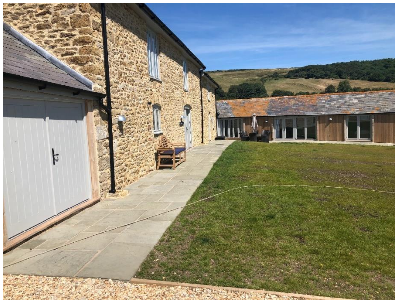
Path to Front Entrance