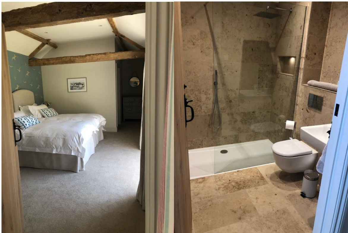
Accessible King/Twin Bedroom