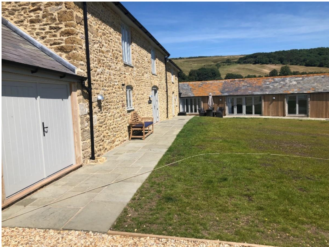
Parking at Furlongs