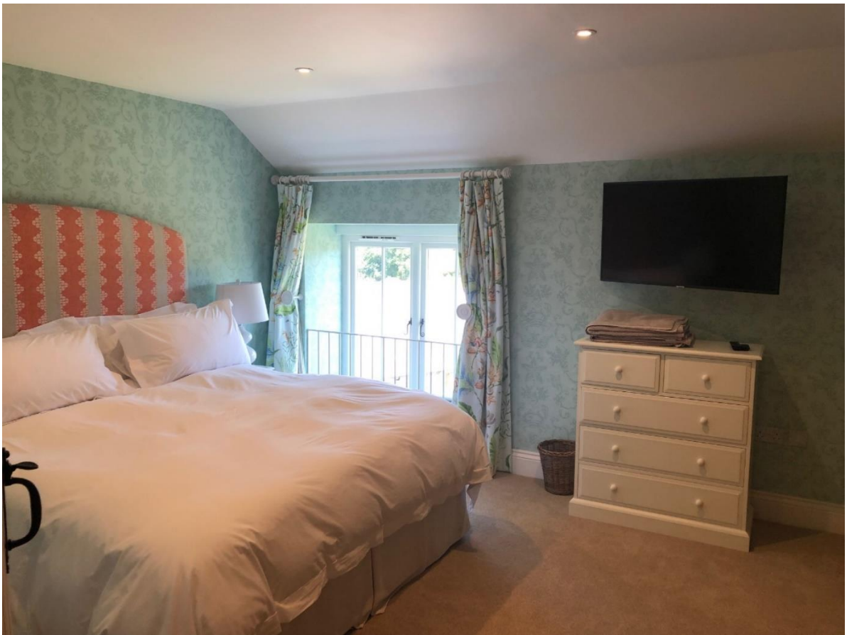
First Floor King Bedroom