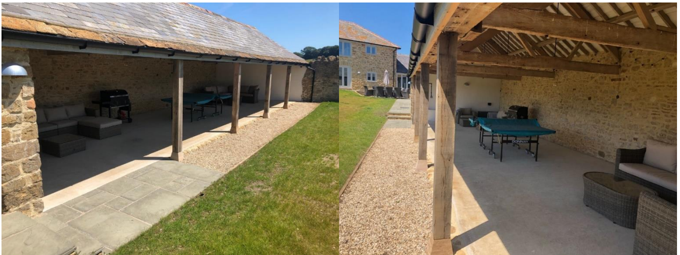
Covered Seating and Games Area