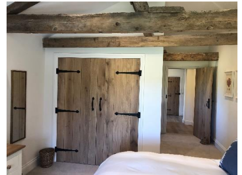
Contrasting walls and Doors