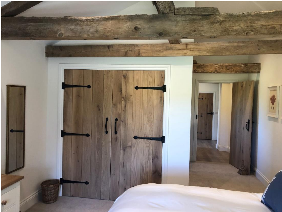
Colour Contrasting Walls and Doors