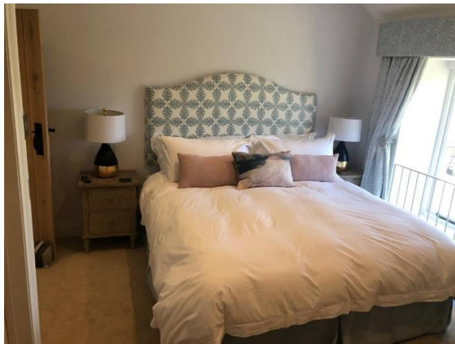
First Floor King Bedroom