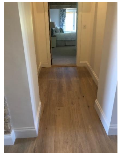
Access to Master Bedroom