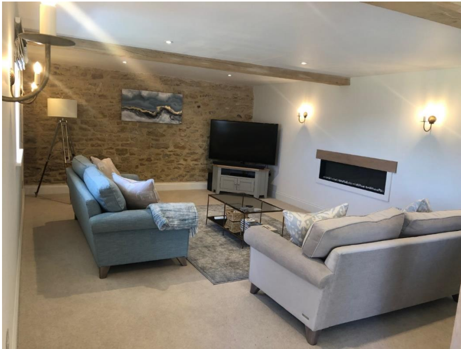
Main Living Area