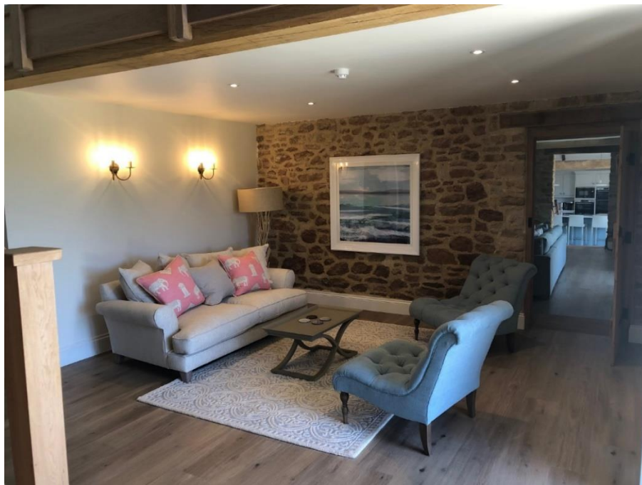
Main Living Area