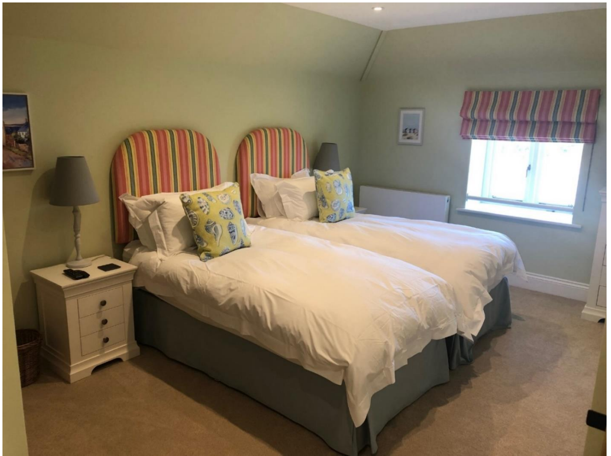
First Floor King/Twin Bedroom