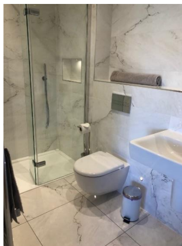
First Floor King Ensuite