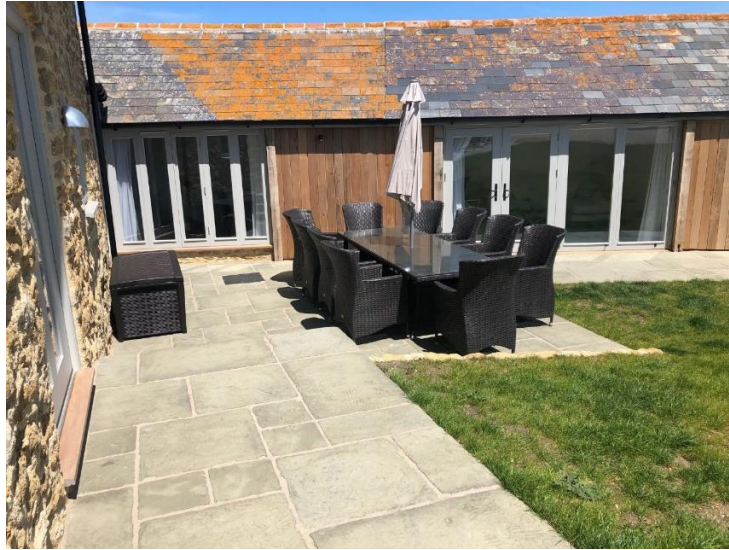
Terrace Seating Area