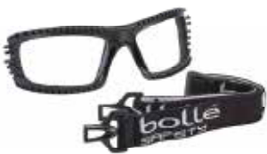
Foam and strap