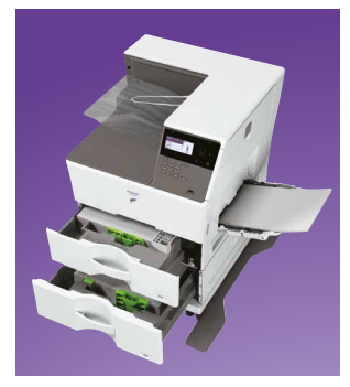
Expandable paper capacity