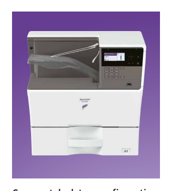
Compact desk top configuration