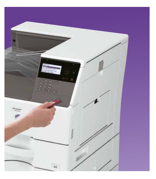
Conveniently located USB port

Choose a high performance printer to get the productivity you require