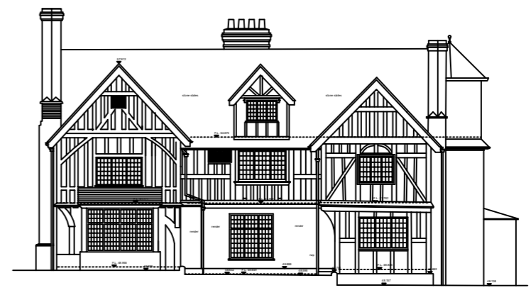
side elevation ( West )