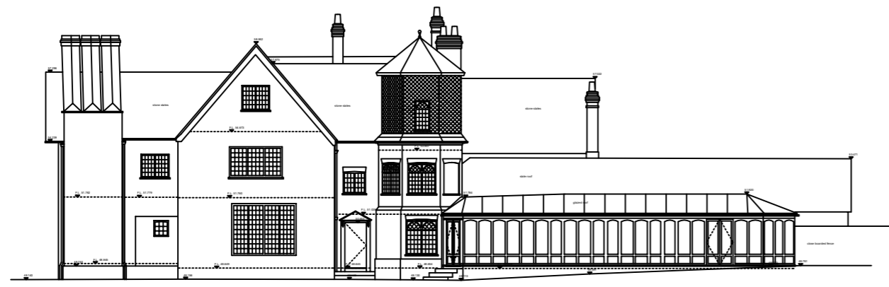
rear elevation ( South )