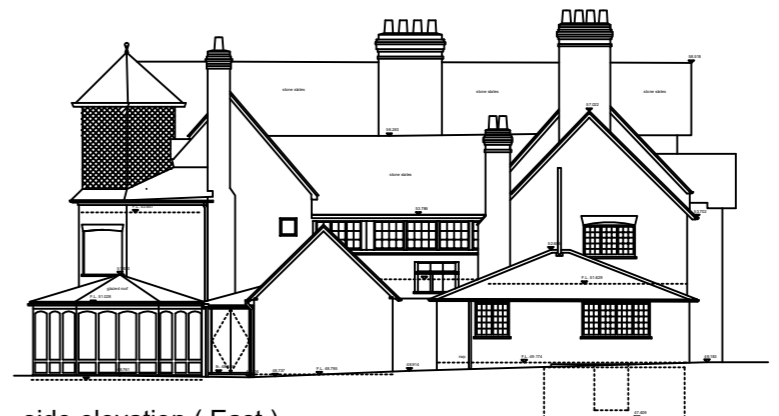
side elevation ( East )