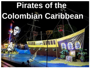
Pirates of the Colombian Caribbean