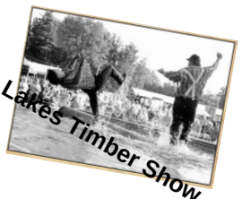
Great Lakes Timber Show