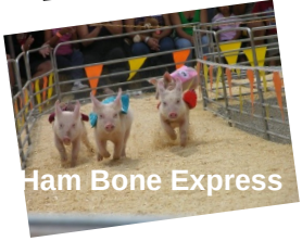
Ham Bone Express