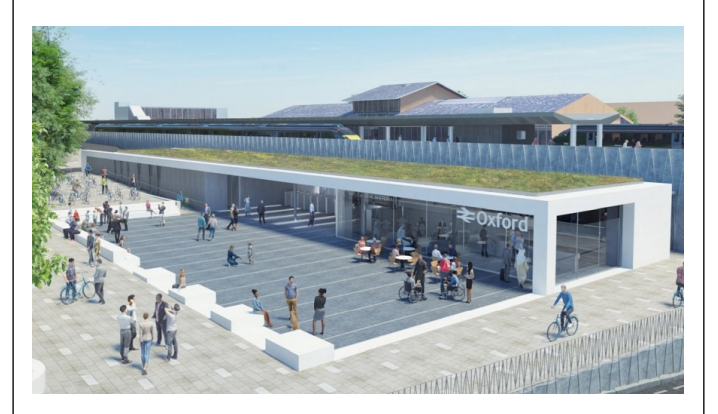
Artist's impression of new Oxford station western entrance

Network Rail have been awarded £78.6m from the Department for Transport to support the redevelopment of Oxford station and railway – providing a bigger and better station, more services for passengers and freight and improved journey times for passengers.