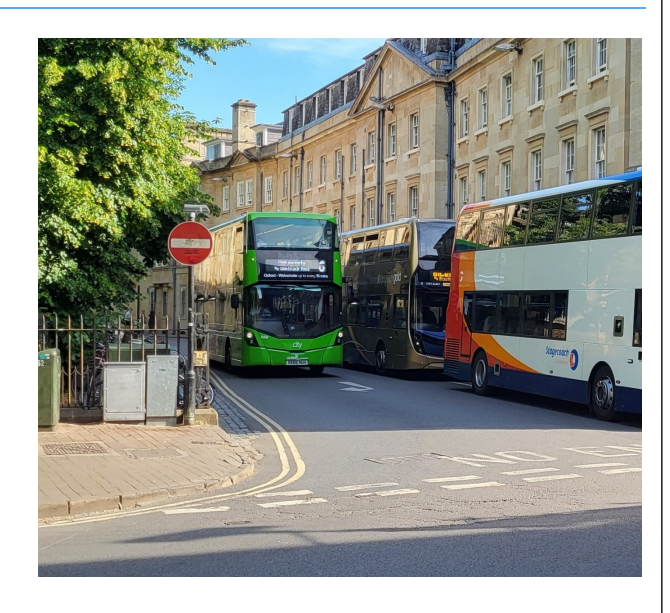
£12.7m will fund cheaper youth fares, bus priority measures and rural services

We've been awarded £12.7 million of government funding to support plans to get people out of their cars and on to buses. Plans include cheaper fares for under-19s and new rural services.