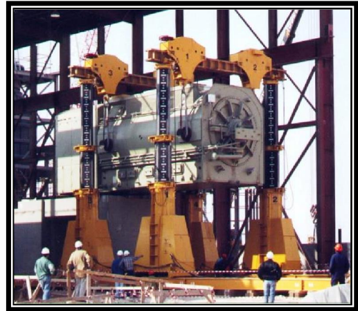
J&R 1402-4-39 Octagon LIFT-N-LOCK Hydraulic Boom Gantry with 150 Ton PowerLinks on a project in Riyadh, Saudi Arabia