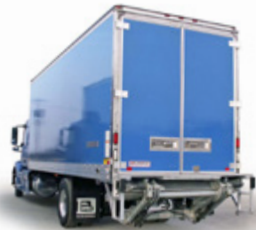
VAN BODY SERVICE