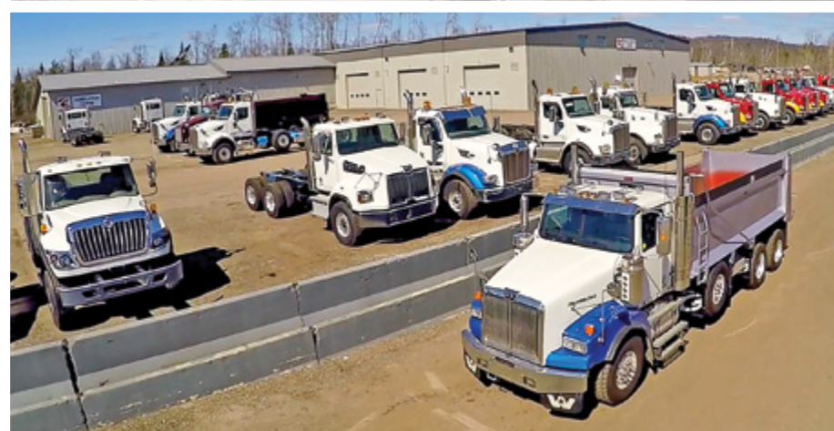
Mattawa, Ontario Facility

bays, and houses thousands of parts for each product line that we carry & support. Most importantly our parts & service staff are trained in all our products, capable of diagnosing electrical, mechanical, hydraulic parts & service needs.