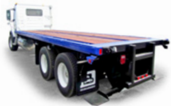
SERVICE FOR DECKS