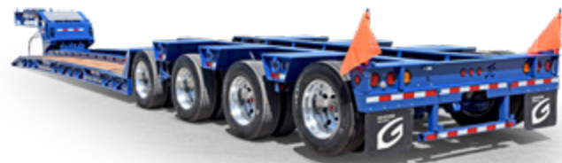
SERVICE FOR TRAILERS