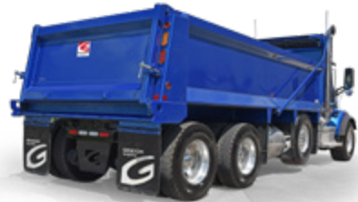
SERVICE FOR CLASS 8 AND SPIF