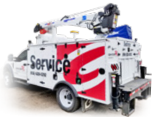
MOBILE SERVICE NORTHERN AND EASTERN ONTARIO