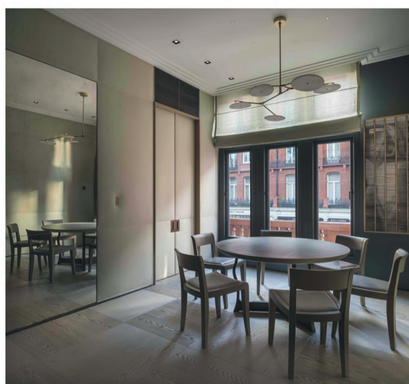
Mayfair Lateral by Elnaz Namaki Studio