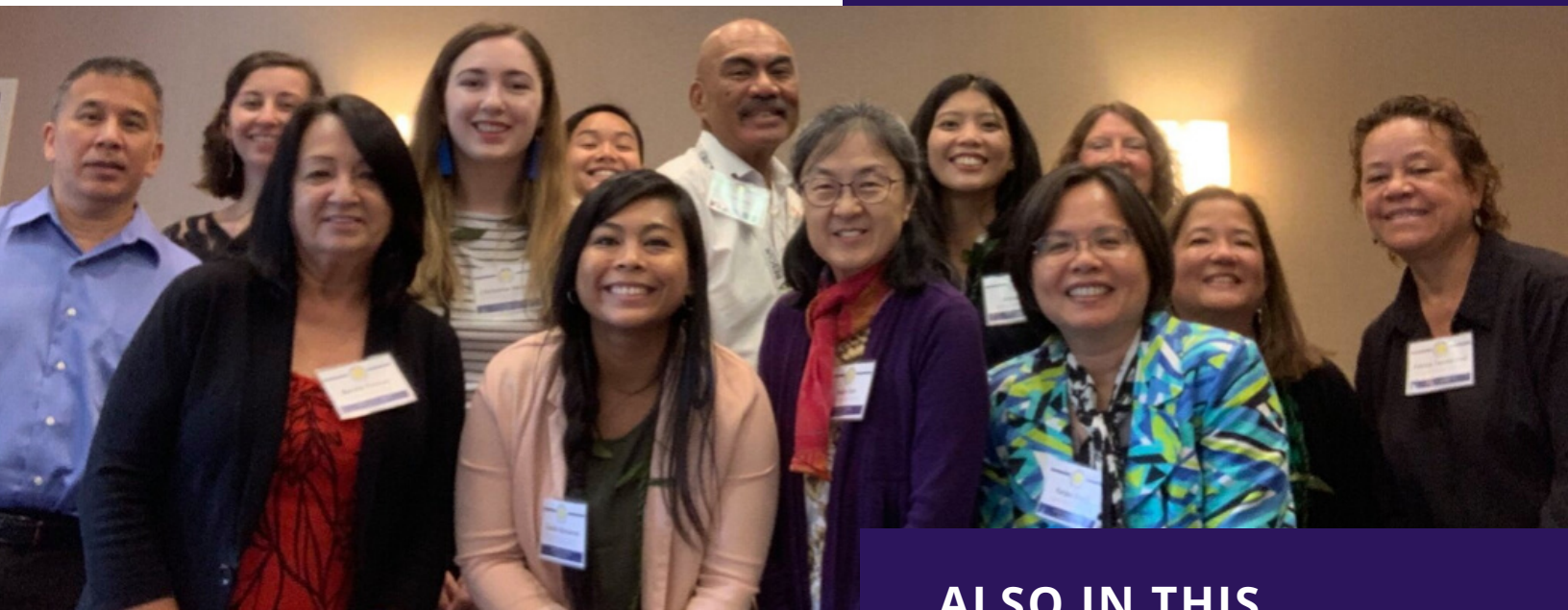
Pictured here: ASPIRE Partners and staff during the first in-person meeting in Minneapolis